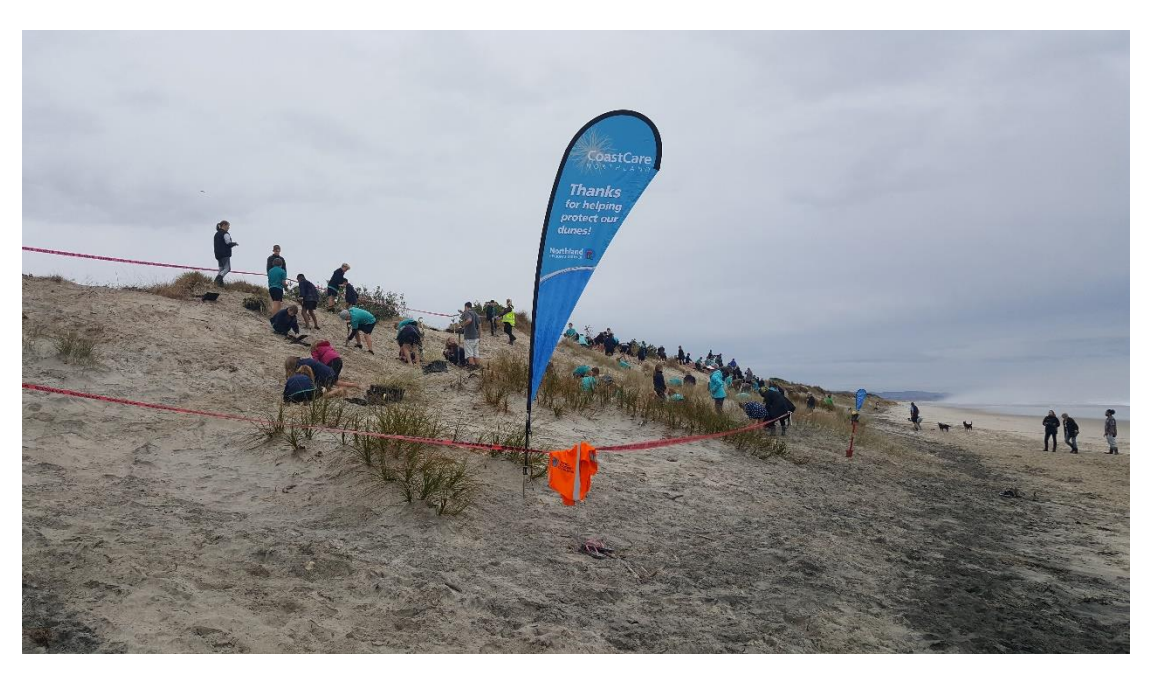
Waipū School planting the dunes at Waipū Cove; one of the CoastCare planting days held this year.