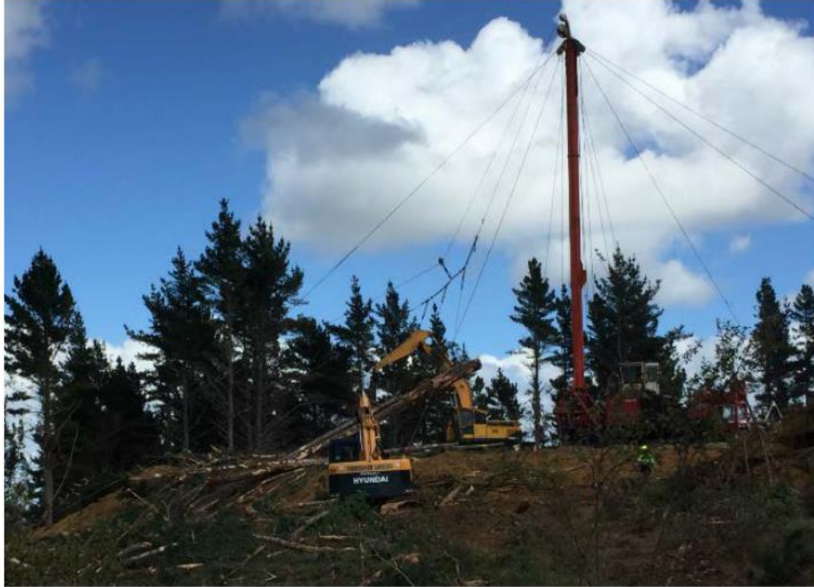
Cable hauler extracting logs.