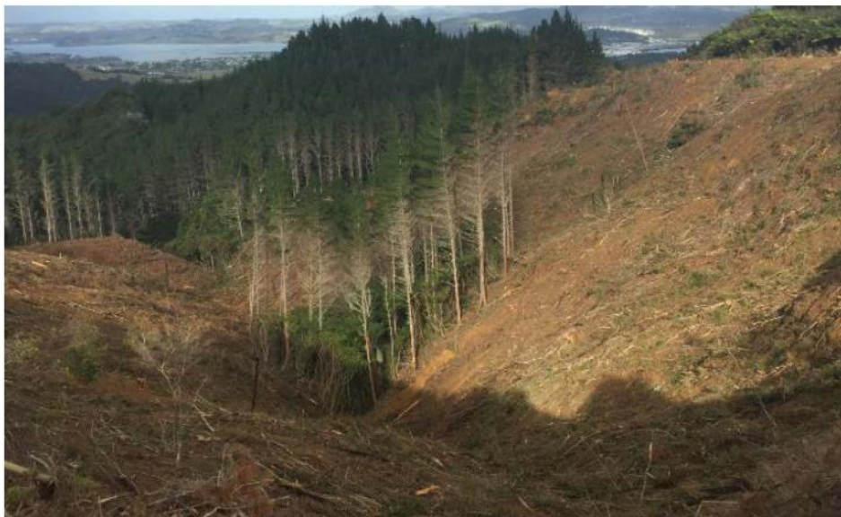
Cutover, with archaeological site prior to final tree felling.