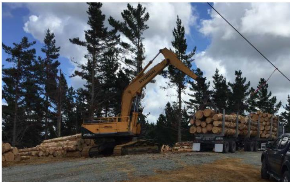
Loading out logs for transport to Marsden Point