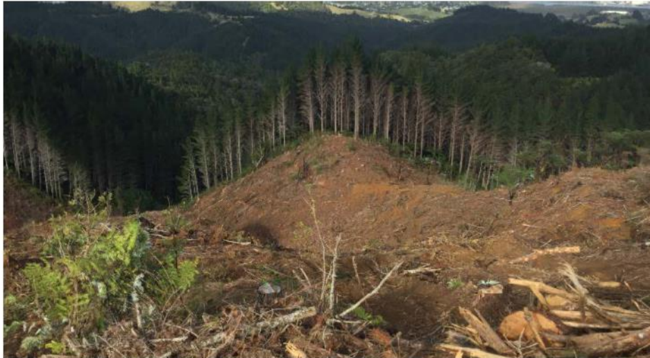
Cutover after harvest, with residual unharvestable area in background